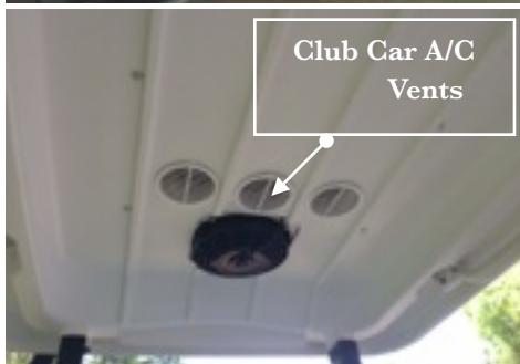
Club Car A/C Vents