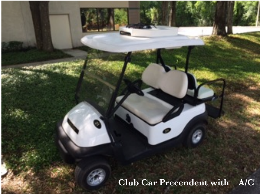
Club Car Precedent with A/C