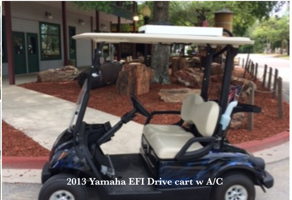
2013 Yamaha EFI Drive cart w A/C

AirColdCart is the new gold standard in comfort for golf carts, OHV, and street legal LSV vehicles. Designed to provide the same level of comfort as we've all grown to expect in our automobiles from these light vehicles. Why suffer when you can have true A/C ?