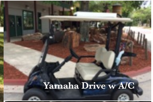
Yamaha Drive w A/C