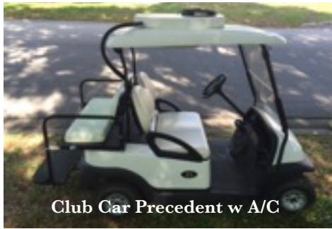
Club Car Precedent w A/C