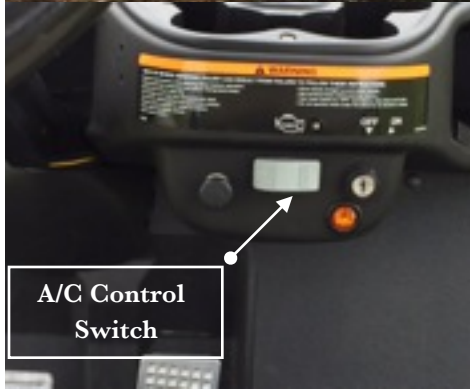
A/C Control Switch

AirColdCart - Used to describe a vehicle that has been modified for improved performance beyond it's original design parameters.