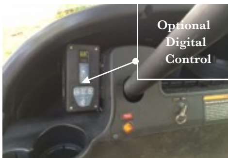
Optional Digital Control